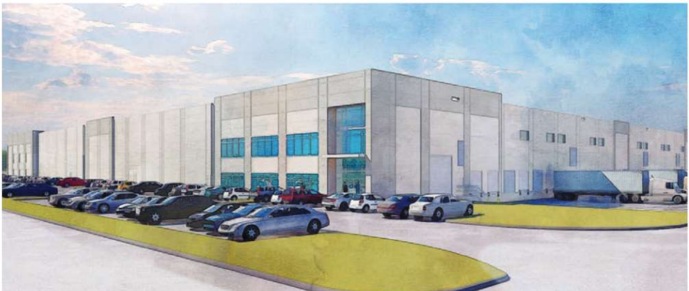
A rendering of Yokohama Tire's new distribution facility in Wilmer, Texas.

The U.S. Bureau of Economic Analysis released 2020 export data on February 5th. This data shows the pandemic had a negative effect on exports across the nation in 2020, but a combination of factors that sustain Texas' economy helped it retain its top spot on the list of exporters by state. "Those factors include Texas' pro-business climate of low taxes and reasonable regulations, its economic diversity, the second largest workforce in the nation, and its award-winning infrastructure — among many others," Allen said.